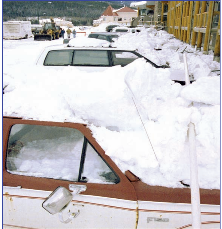
Photo 4 – A snow retention code needs to be put in place to help prevent injury to people and damage to property.

There are many other codes in place to protect people and property, so why not for snow retention? We have codes for wind uplift and ICC test standards for product failures due to wind and moisture penetrations, to name a few. How many life-threatening events ( Photo 4 ) need to occur before we do the right thing when it comes to a code for snow retention on roofs?