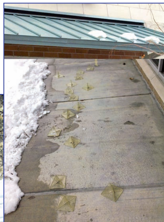
Photo 2 – These plastic snow guards fell to the ground because the adhesive did not bond properly.