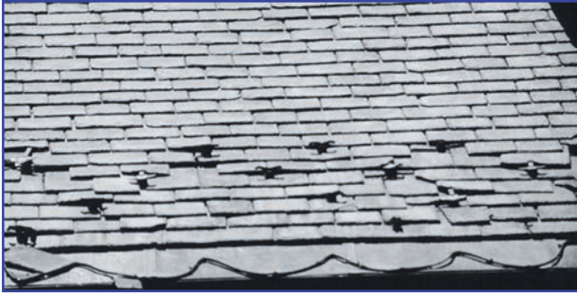
Photo 3 – This snow retention system was not engineered for some variable of the project that caused it to fail.